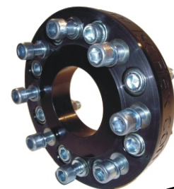
IFC8200 coupling shown